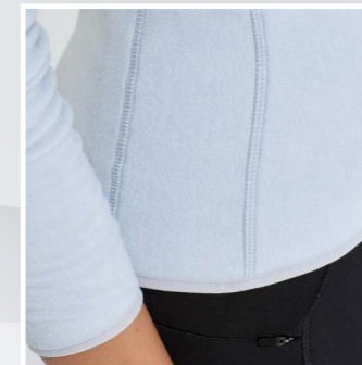
Flattering slim fit