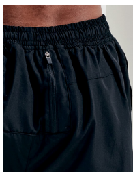
Back zip pocket